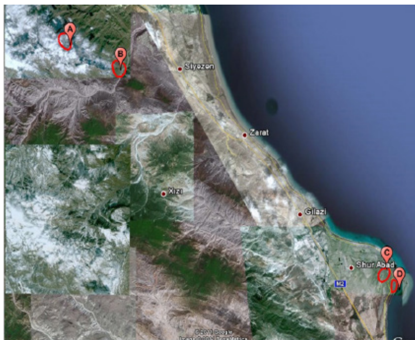
FIGURE 1. Map showing the study area

Lowland. The front mountain belt covers an area from 200-250 m up to 800-1000 m above the sea level.